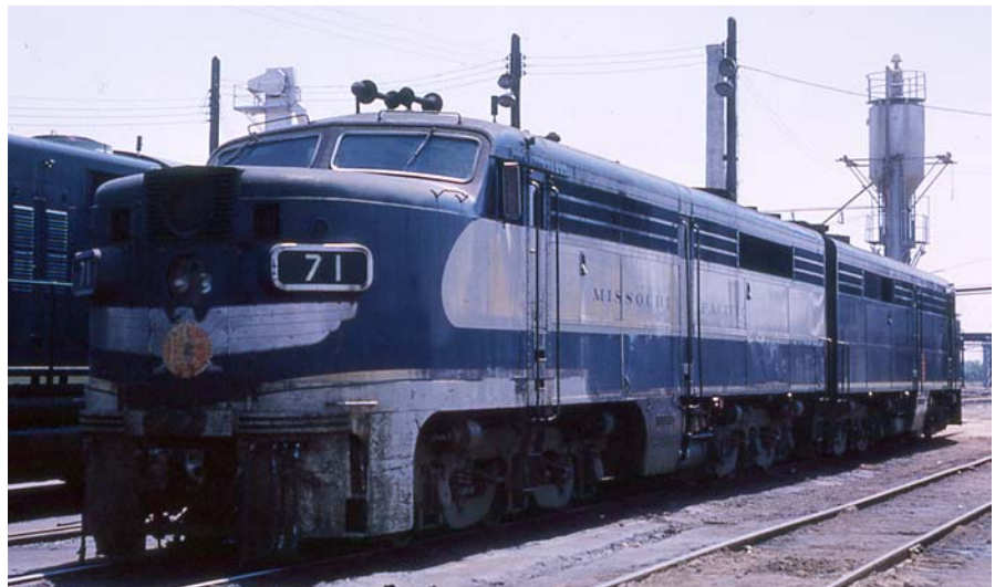
MoPac Alco PA2 No. 71 is seen here late in life in June 1963 at Fort Worth. When delivered in 1952 the locomotive was numbered 8028; it was sold for scrap in 1965.

need modifications. For example, MoPac PAs didn't have dynamic brakes so I had to remove the dynamic brake-related items modeled on the top of the shell. I also added a "fire cracker" antenna and a prime mover intake and vent.