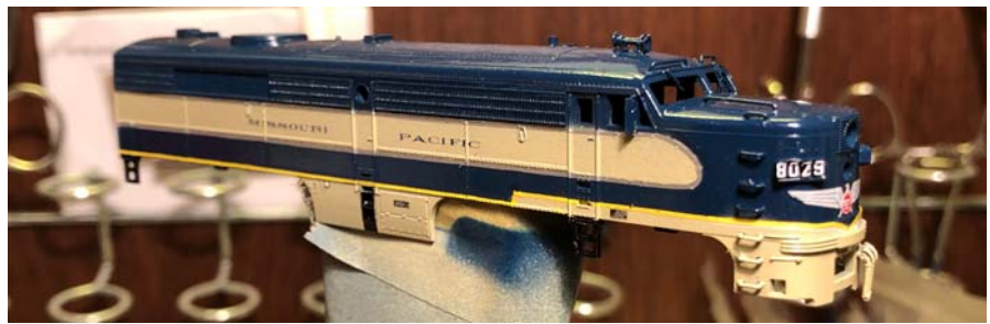
No. 8029 is resplendent in full MoPac Eagle colors.

I research before starting a project, using data from books I purchase from hobby shops and train shows. The research makes the models more accurate. With research, I knew I needed a late model PA for this project, but the shell would still