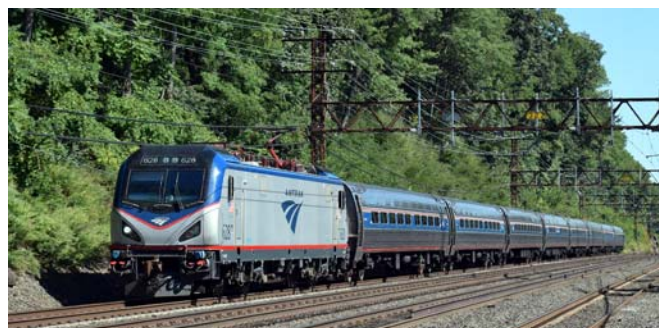
Above, a new Amtrak ACS-64 highballs through Cos Cob, Conn., with a consist of Amfleet I cars.

Diesel fans are not being left out of the fun, which will spread from coast-to-coast.