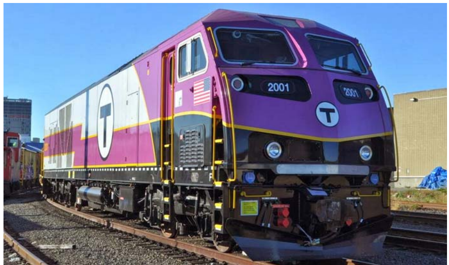
Top, an artist's rendering of Siemens' Charger diesel locomotive decked out in the proposed "Brightline" livery.