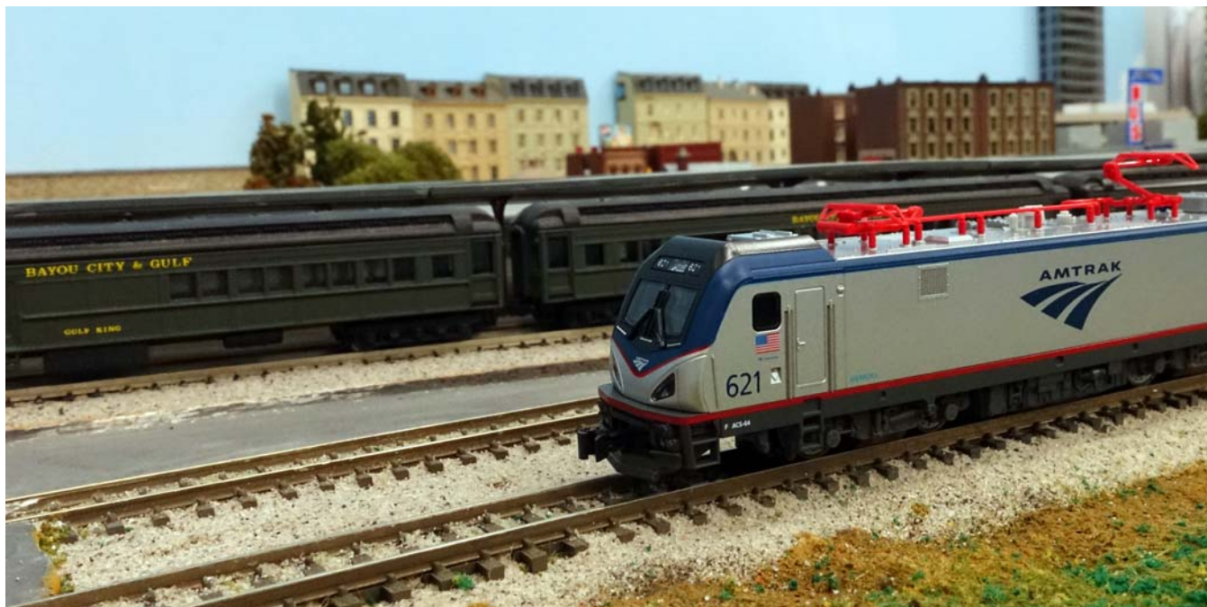
A brand new Amtrak ACS-64 Cities Sprinter toured the Bayou City & Gulf in mid-November of this year.

Their names are Spirit , Charger and Cities Sprinter , and they are the new faces of passenger railroading in the U.S. You will soon be able to accurately model trains hauled by one of these new locomotives in N scale, and given the number of orders placed for it to date, another of these new locomotive designs seems likely to appear in model form in the not-too-distant future as well.